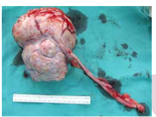
Figure 4. A mass involving the left ovary of the dog of figure 1 following complete ovariohysterectomy.