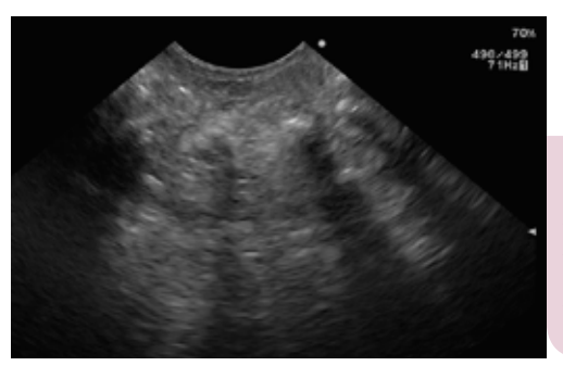
Figure 3. Ultrasonographic abdominal image of the dog of figure 1 showing the presence of several hyperechoic foci casting a clear shadow.